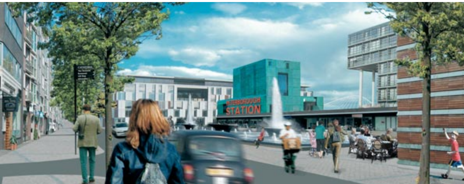
Artist's impression of the proposed new Peterborough Station Square West

Exhibition available for viewing (but unstaffed)